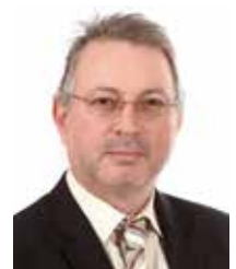
Dean Packer Expert Support

The Dispute Solutions team provides a proactive approach to assist clients in avoiding or resolving disputes. Drawing on the skills developed from a background of construction management and project delivery, the Dispute Solutions team offer a focused approach based around: