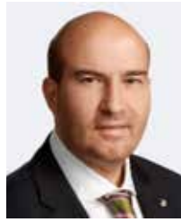
Moneer Khalaf Testifying Expert/ Arbitrator