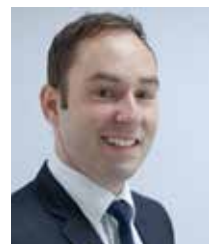
Christian Swift Expert Support

The Dispute Solutions team provides a proactive approach to assist clients in avoiding or resolving disputes. Drawing on the skills developed from a background of construction management and project delivery, the Dispute Solutions team offer a focused approach based around: