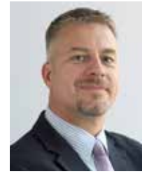
Ian Maund Testifying Expert